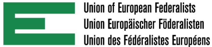
Union des fédéralistes européens -UEF France