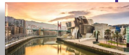
BILBAO (SPAIN) 13-14 March 2020