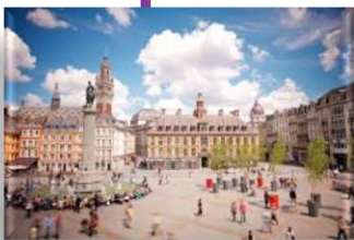
LILLE (FRANCE) 25 January 2020