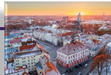
TARTU (ESTONIA) 28-29 February 2020