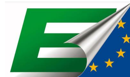
Unión de Europeístas y Federalistas de España-UEF Spain