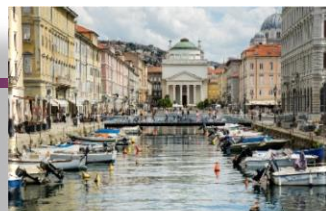
TRIESTE (ITALY) 20 February 2020